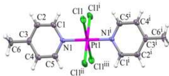
Fig. 2. The labeled diagram of trans -[Pt(4-mpy) 2 Cl 4 ] ( 1 ). Thermal ellipsoids are at 30% probability level. Symmetry codes: (i) -x,-y,-z; (ii) -x,y,z and (iii) x,-y,-z.

Crystal packing diagram for this complex is shown in figure 3. As it is shown in this figure, there are no any hydrogen-bonding in the crystal packing. In the crystal packing of this complex, the coordinated 4-methylpyridine ligands form \pi bonding stacks in which each pyridine ligand lies between two pyridine ligands of adjacent platinum complexes. The centroid to centroid distance between adjacent aromatic rings is 3.830(2)Å. These several \pi \dots \pi interactions causing on the stabilization of this complex in the crystal packing.